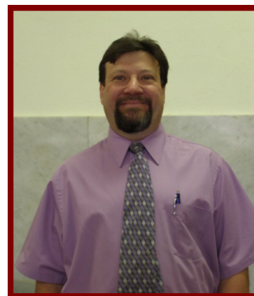
Right: Bradford County Library Director