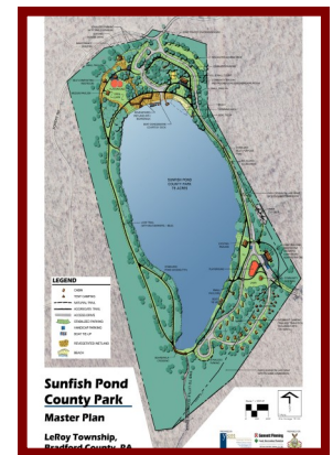
Sunfish Pond Park