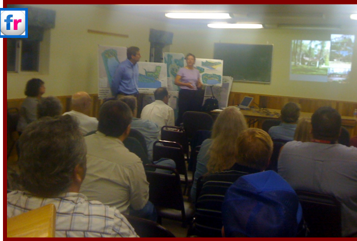
Above: Representatives from YSM present the Bradford County Parks Master Plan at a public meeting in Wysox

A public meeting to present the county parks master plan was held on September 30, 2010, at 6:00 p.m. Despite the hard rain many residents came out to see the presentation and see what the future holds for the three county parks.