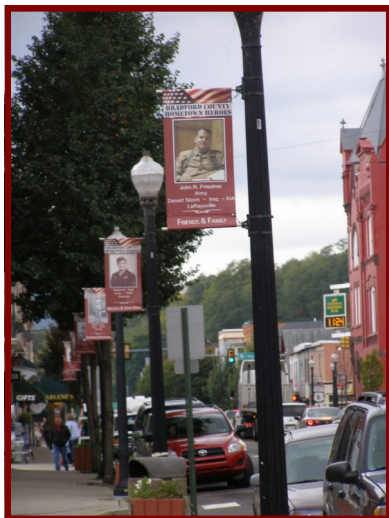
Above: The Hometown Heroes Banner Project has been gracing the streets of Towanda

The Friends of the Bradford County Library, Towanda Borough, and the Bureau of Veterans Affairs are pleased to announce that they are again sponsoring the hometown heroes program.