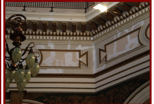
The cleaning, repair of plaster and repainting of the Courthouse Cornice has begun!