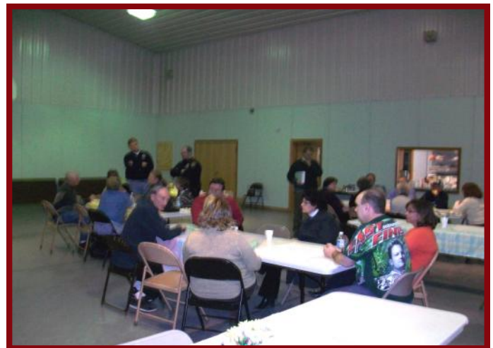
Break out session of community members at the recent town hall meeting held at First Baptist Church in Troy.

They were asked three questions regarding underage drinking. The first question was “What are our thoughts on underage drinking? They were given fifteen minutes to discussion and write their thoughts down. Some of the comments were: “A mess”, “rampant”, “socially acceptable”. The participants were then asked to move two more times during the evening to a new table with new people to discuss the other two questions. “Where are young people getting the alcohol”. Some answers that were given were “Friends”,