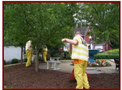
Above: Inmates on program working on a community park in Wyalusing Borough.

graffiti removal, various public works projects, special events, maintenance, or general public property clean-up. Bradford County inmates completed 9 jobs in 9 weeks with 992 hours of inmate labor. Communities served by the inmates include Ridgebury, Towanda, Rome, Wyalusing, and South Waverly.